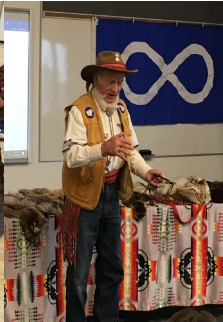
Grade 5 & 6 Science Expo